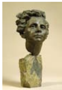
Rachel Carson , 1965 Una Hanbury

1 Twentieth-Century Americans, 1980–Present