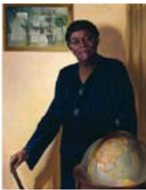
Mary McLeod Bethune , 1943 Betsy Graves Reyneau

2 Twentieth-Century Americans, 1950–1980