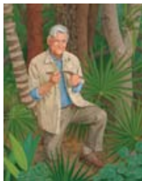
E.O. Wilson, 2006