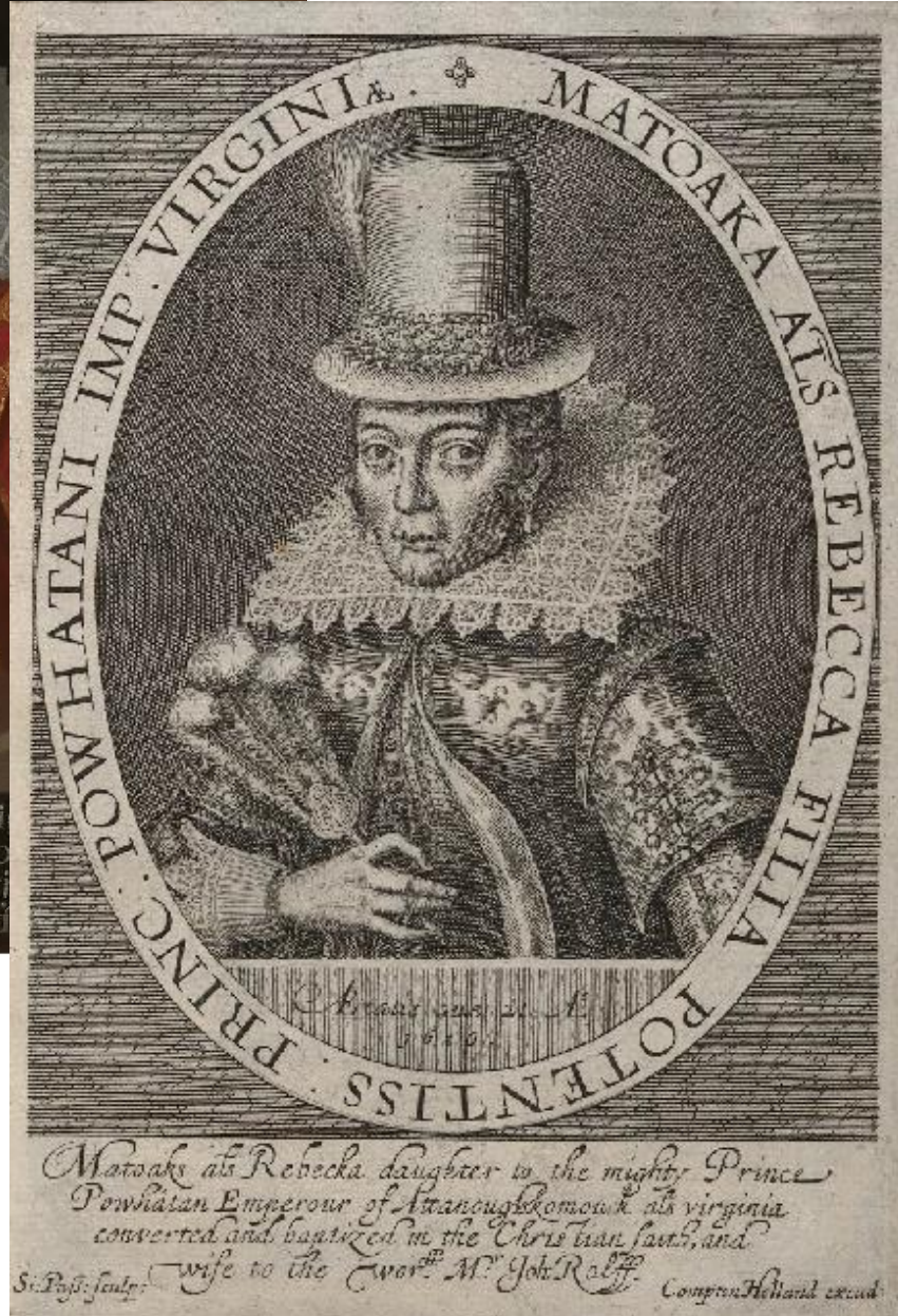
Matoaka als Rebecca daughter to the mighty Prince Powhatan Emperour of Attanoughkomo converted and baptized in the Christian faith, and wife to the wor th M r John Rolfe S: P: f: sculp: Compton Holland excudit

Pocahontas, illustration in Baziliwlogia a Booke of Kings..., by Simon van de Passe, 1616. National Portrait Gallery, Smithsonian Institution