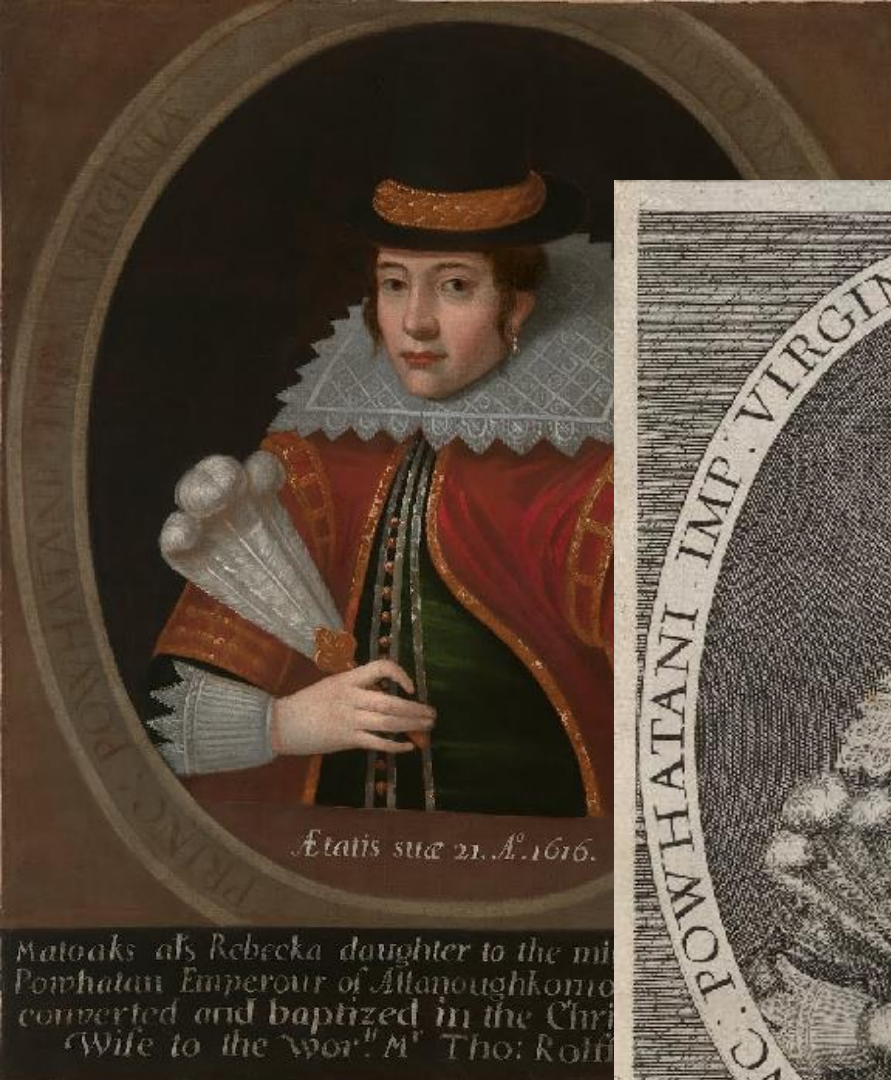
Matoaka als Rebecca daughter to the mighty Powhatan Emperour of Attanoughkomo converted and baptized in the Christian faith, and wife to the wor th M r Tho: Rolfe

Pocahontas, by Unidentified Artist, after 1616. National Portrait Gallery, Smithsonian Institution